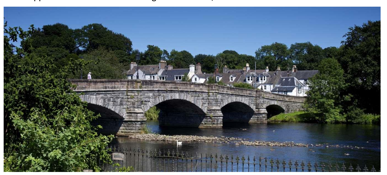
A 3-night stay is planned at the hotel for the duration of the Learning Journey <a href="http://www.creebridge.co.uk/">http://www.creebridge.co.uk/</a>

21.00 Approximate arrival at Creebridge House Hotel, Newton Stewart