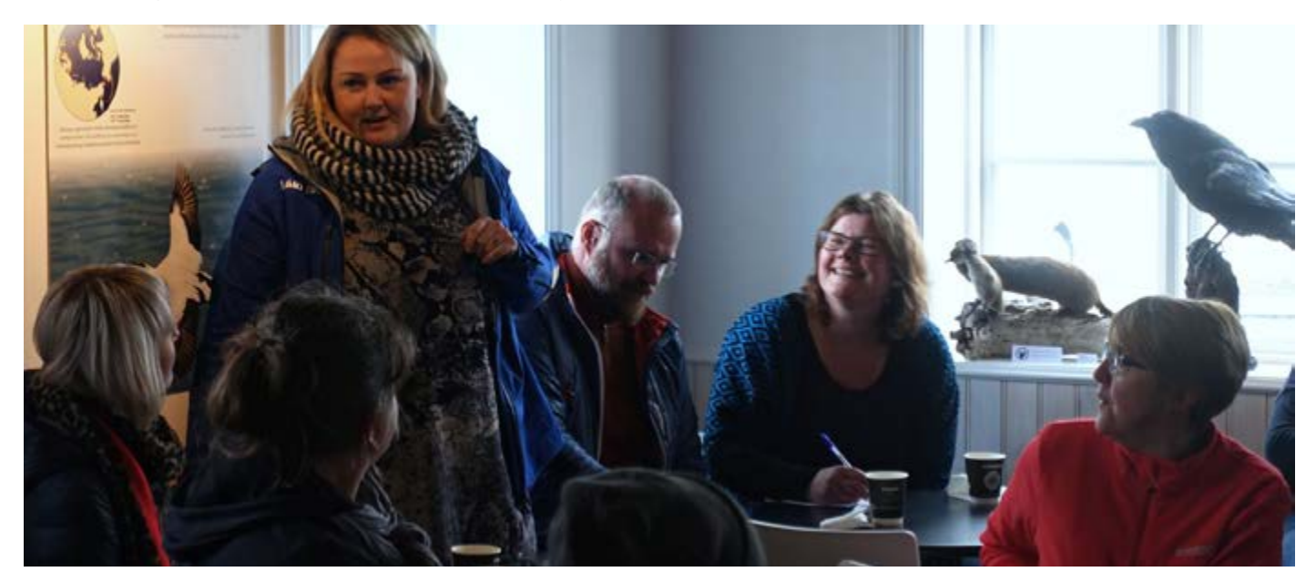
SHAPE partners meeting with stakholders in Snæfellsnes, Iceland.

An important task over the next few months will be to make contact with stakeholders in each area to explain what we aim to achieve in SHAPE and to discuss the ways in which their participation can contribute to community development and heritage protection. Our first regional stakeholder meetings will take place in each sustainable heritage areas in early 2018 where we seek to establish a collective understanding of the cultural and natural value of the area. This will also be an opportunity to learn from stakeholders about the challenges and successes of local ecotourism initiatives.