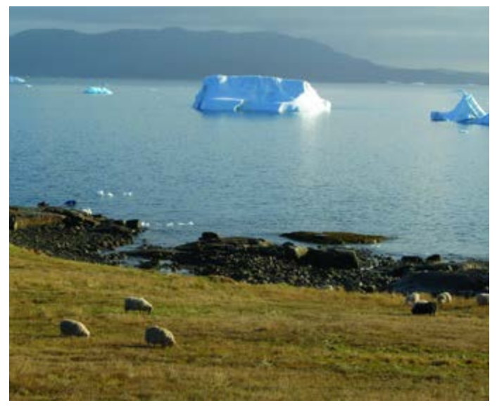
Sheep grazing along a fjord in Kujataa, Greenland.

The inscribed property is made of five component parts which together represents the demographic and administrative core of two diachronic farming cultures; the Norse Greenlanders of the late 10th to mid-15th centuries AD and the Inuit farmers of Kujataa from the 1780s to the