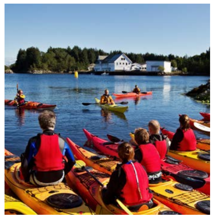
There are great opportunities for tourism based water-activities such as kayaking, on the west coast of Nordhordland, Norway.

The five municipalities in Snæfellsnes have been environmentally certified by EarthCheck. For more information go to www.snaefellsnes.is .