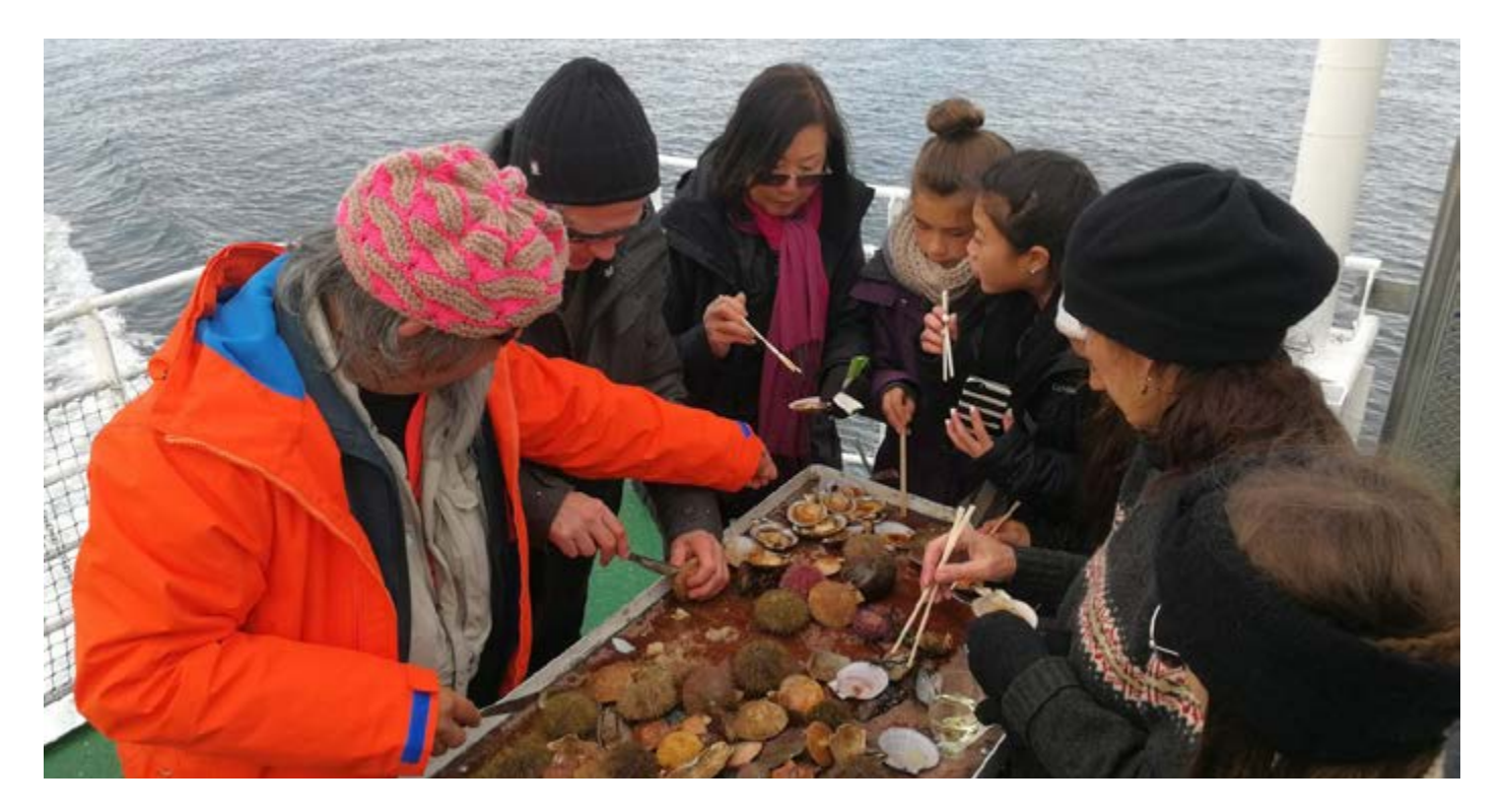
Tourists in Snæfellsnes, Iceland, getting a sense of the rich heritage of Snæfellsnes with a boat trip around Breiðafjörður bay, including the fabulous taste of just-fished raw scallops.

SHAPE partners participated in an asset mapping workshop at the second partner meeting, to develop methods for mapping and managing assets in their SHA. In this workshop partners agreed on participatory processes for mapping natural and cultural heritage, identifying existing and desirable infrastructure, linking assets, assessing potential climate change impacts in each area, and engaging stakeholders in the process. By the end of the workshop, partners had developed an approach and decided on tools for asset mapping in their SHA.