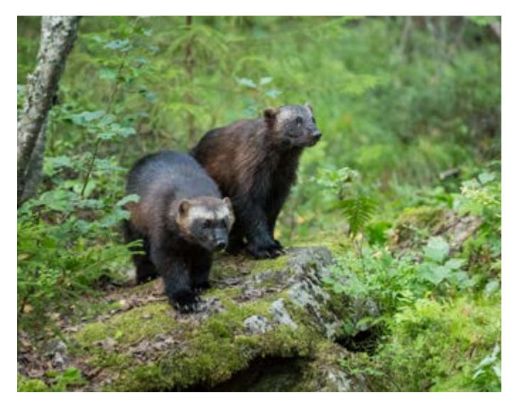
Wolverine at Era-Eero wildlife lodge.

Karelia UAS, located in Joensuu, Finland, provides broadbased, high-level and internationally competitive higher education for the needs of the changing regional and national industry, commerce and other working life. Karelia operates in seven study fields offering 21 programmes