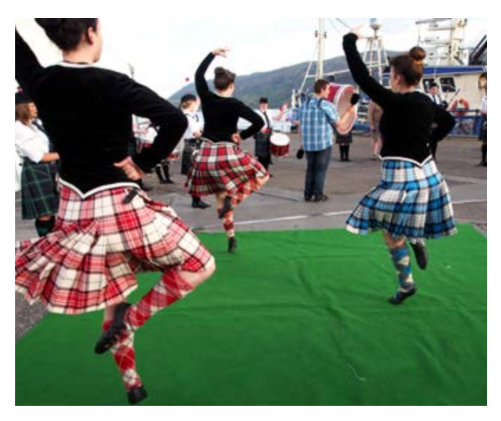
Traditional dancers in Wester Ross, Scotland.

The 'bottom up' approach of this project reaches more people who might otherwise not be engaged and builds a solid foundation of awareness and support for the Biosphere. There has already been enthusiasm for this approach, genuinely giving local citizens the opportunity to be involved in shaping their future sustainability.