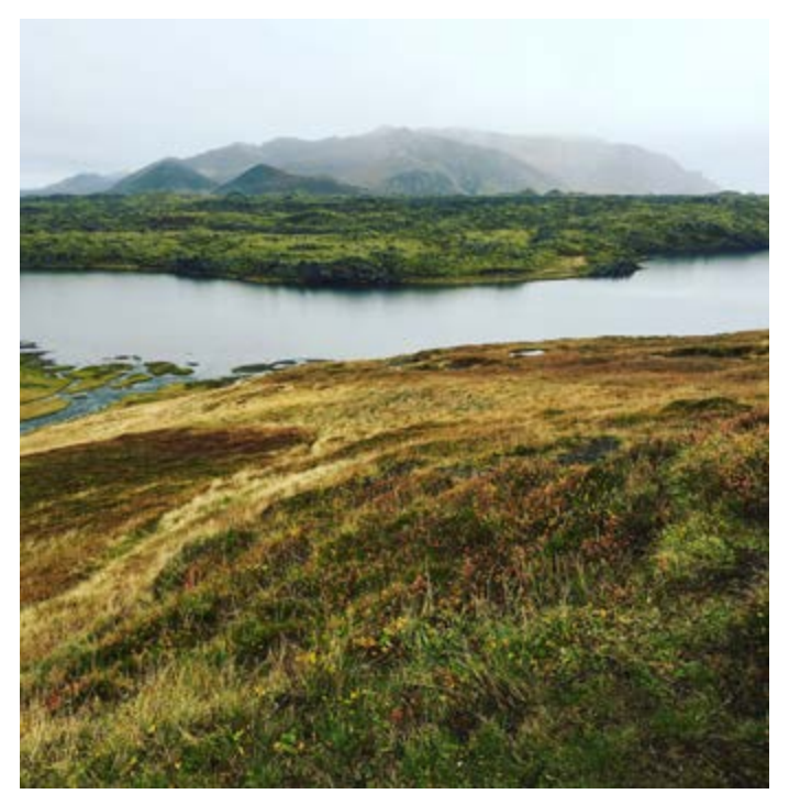
The volcanic landscape of Snæfellsnes attracts many tourists.