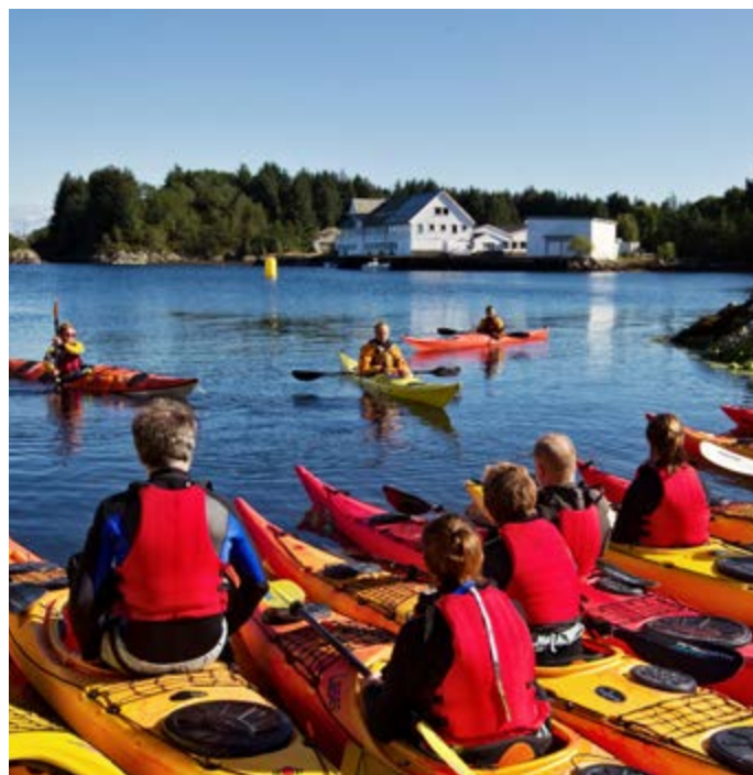
There are great opportunities for tourism based water-activities such as kayaking, on the west coast of Nordhordland, Norway.

The five municipalities in Snæfellsnes have been environmentally certified by EarthCheck. For more information go to www.snaefellsnes.is .