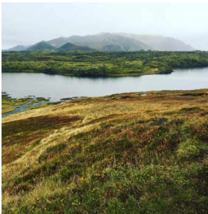
The volcanic landscape of Snæfellsnes attracts many tourists.