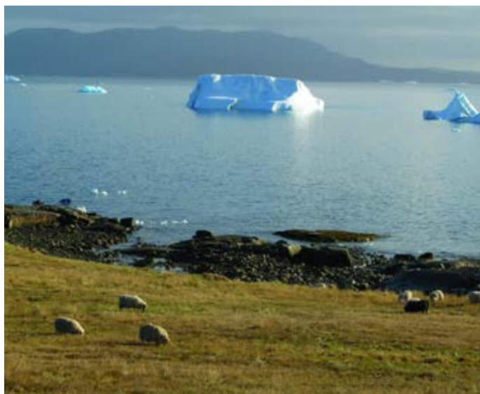
Sheep grazing along a fjord in Kujataa, Greenland.

The inscribed property is made of five component parts which together represents the demographic and administrative core of two diachronic farming cultures; the Norse Greenlanders of the late 10th to mid-15th centuries AD and the Inuit farmers of Kujataa from the 1780s to the