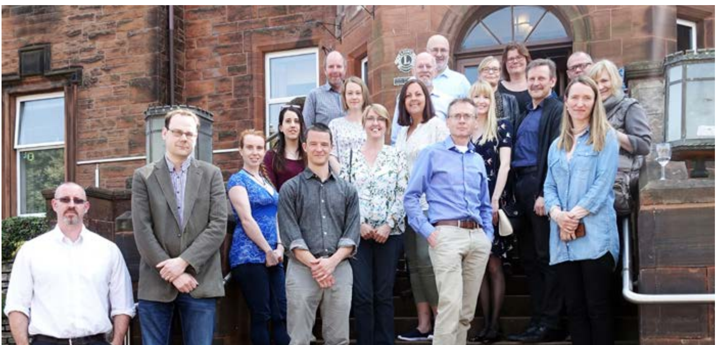
SHAPE partners meeting in Dumfries, May 2017.