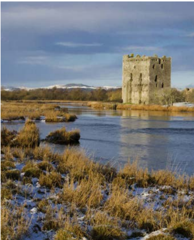
Threave Castle and River Dee in winter-AWP.

For more information on the Biosphere go to http://www.gsabiosphere.org.uk/