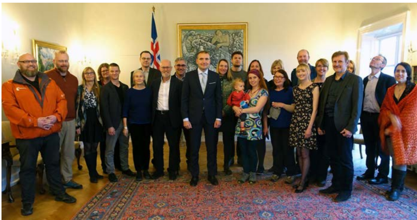
SHAPE partners meeting with the President of Iceland, Guðni Th. Jóhannesson, at Bessastaðir.

Last but not least, we had the pleasure of meeting the President of Iceland, Guðni Th. Jóhannesson, at Bessastaðir, his residence near Reykjavik, who showed great interest in SHAPE and engaged us in a discussion about the opportunities and challenges of ecotourism in Iceland.