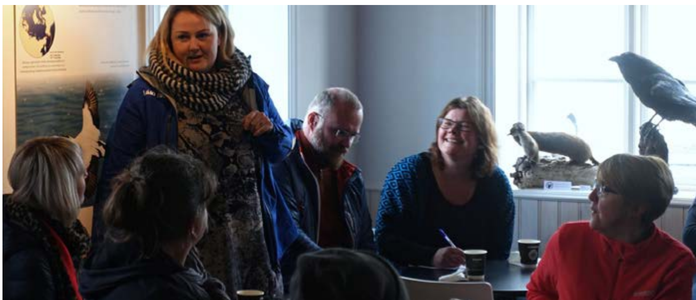
SHAPE partners meeting with stakeholders in Snæfellsnes, Iceland.

An important task over the next few months will be to make contact with stakeholders in each area to explain what we aim to achieve in SHAPE and to discuss the ways in which their participation can contribute to community development and heritage protection. Our first regional stakeholder meetings will take place in each sustainable heritage areas in early 2018 where we seek to establish a collective understanding of the cultural and natural value of the area. This will also be an opportunity to learn from stakeholders about the challenges and successes of local ecotourism initiatives.