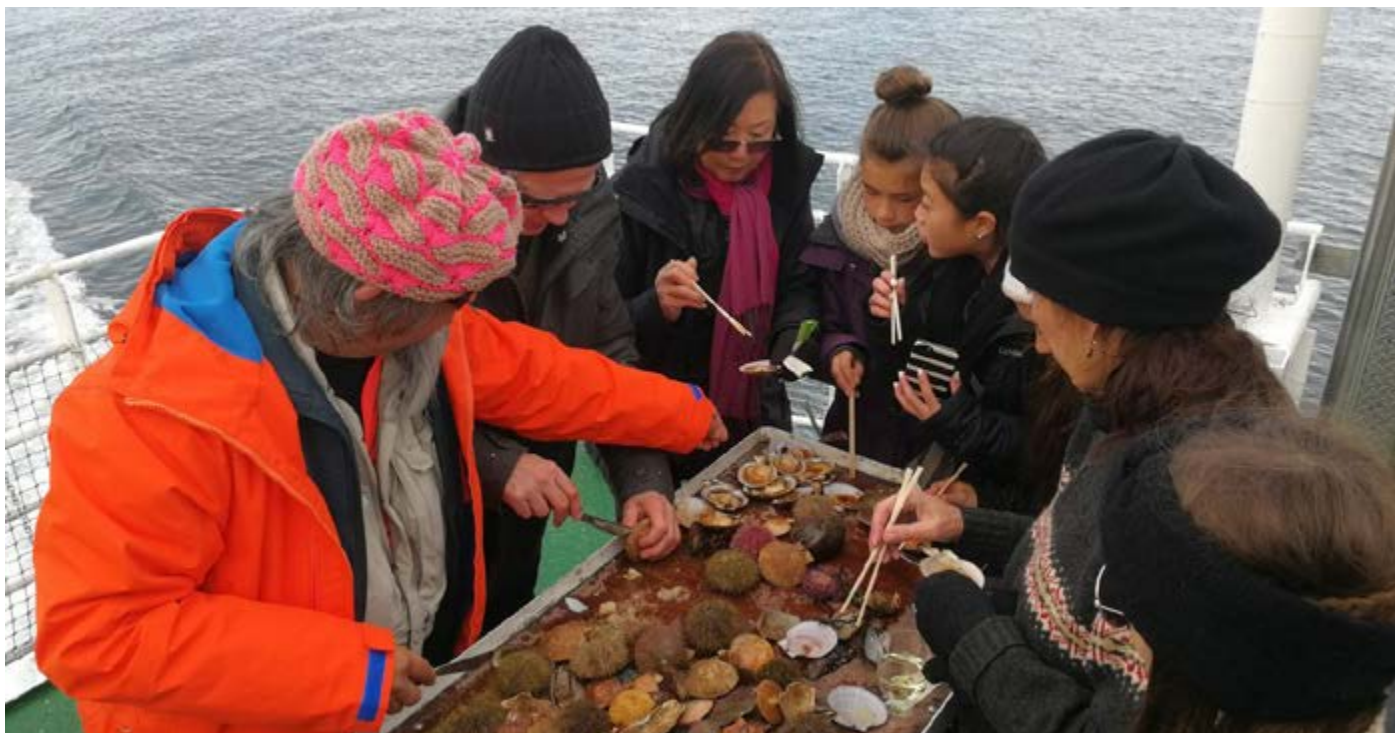
Tourists in Snæfellsnes, Iceland, getting a sense of the rich heritage of Snæfellsnes with a boat trip around Breiðafjörður bay, including the fabulous taste of just-fished raw scallops.

SHAPE partners participated in an asset mapping workshop at the second partner meeting, to develop methods for mapping and managing assets in their SHA. In this workshop partners agreed on participatory processes for mapping natural and cultural heritage, identifying existing and desirable infrastructure, linking assets, assessing potential climate change impacts in each area, and engaging stakeholders in the process. By the end of the workshop, partners had developed an approach and decided on tools for asset mapping in their SHA.