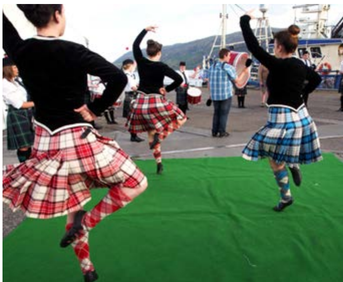
Traditional dancers in Wester Ross, Scotland.

The ‘bottom up’ approach of this project reaches more people who might otherwise not be engaged and builds a solid foundation of awareness and support for the Biosphere. There has already been enthusiasm for this approach, genuinely giving local citizens the opportunity to be involved in shaping their future sustainability.